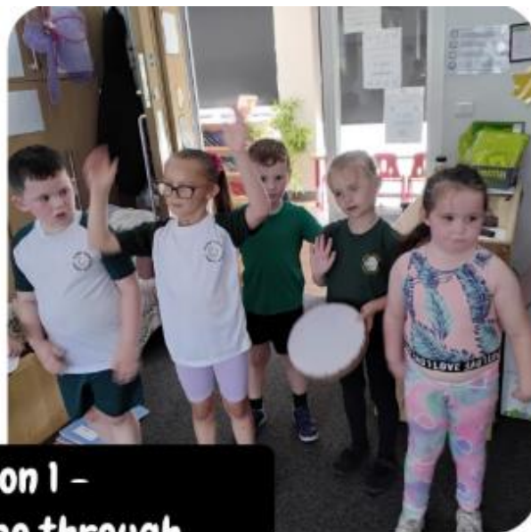
Music lesson 1 – Exploring tempo through movement