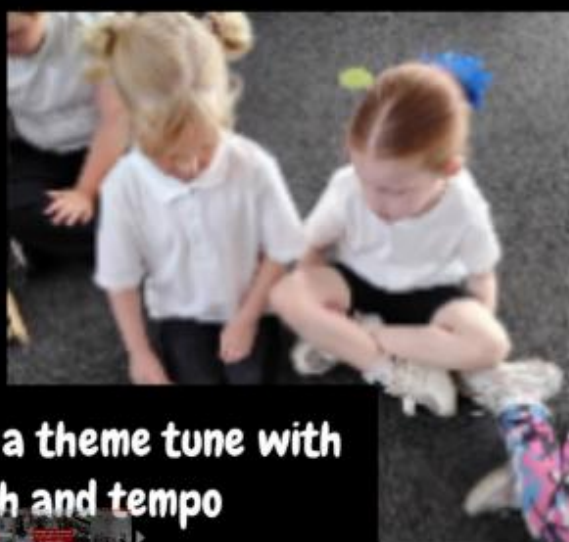
Lesson 4 - creating a theme tune with varying pitch and tempo